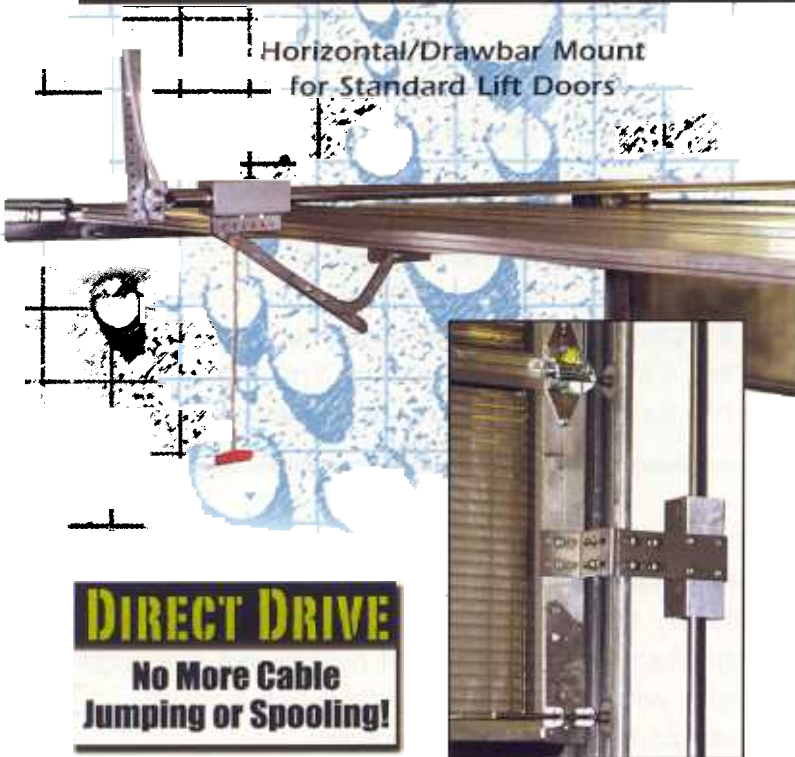
Horizontal/Drawbar Mount for Standard Lift Doors

Versatile enough to meet your particular door systems needs, MagneLift™ can be installed horizontally or vertically to fit your standard or custom requirements.